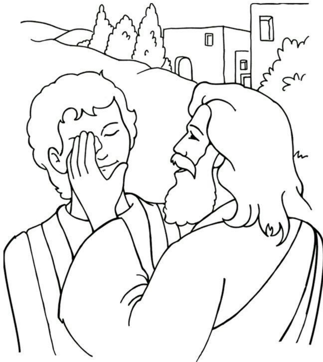
Jesus Heals a Man Born Blind John 9